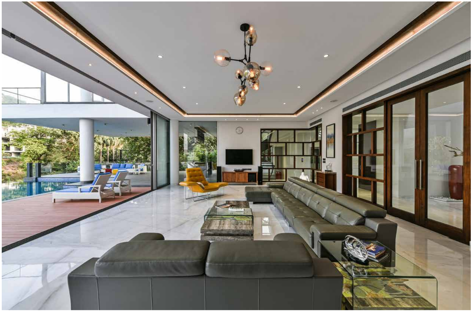
The living room enjoys panoramic views of the surrounding regions as dictated by the design brief and its execution. The living room follows an open plan, including the dining area within its circulation scheme. An interesting exotic Brazilian granite forms a feature wall in the living room.