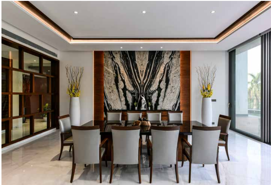
Molded with simplistic zonal principles of home design, the more public zones of the house such as the living area, guest room, kitchen, common guest room and the spa and Jacuzzi are all located on the ground floor.