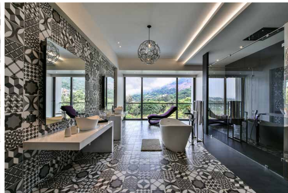
A bathroom sits next to the daughter's bedroom. The use of black and white patterned tiles adds to the look and feel of the space, setting it apart.