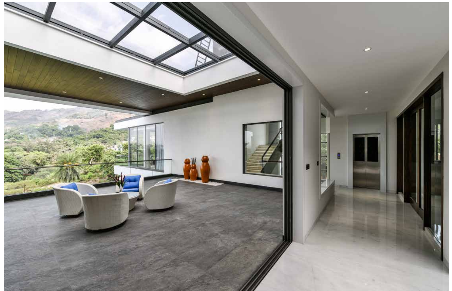
Little corners of sitting have been designed to fit inside the plan of the villa as avenues of viewing the scenery around.