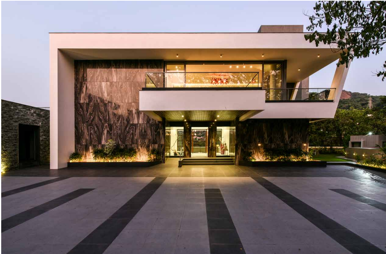
Clean, straight lines define the façade and frame it against the backdrop of lavish natural landscape.