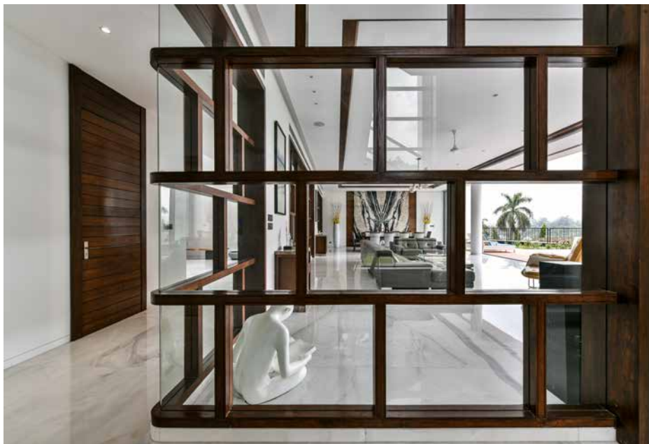
A glass and wooden screen separates the living room on one side and has 40 feet opening on the other facing the valley.