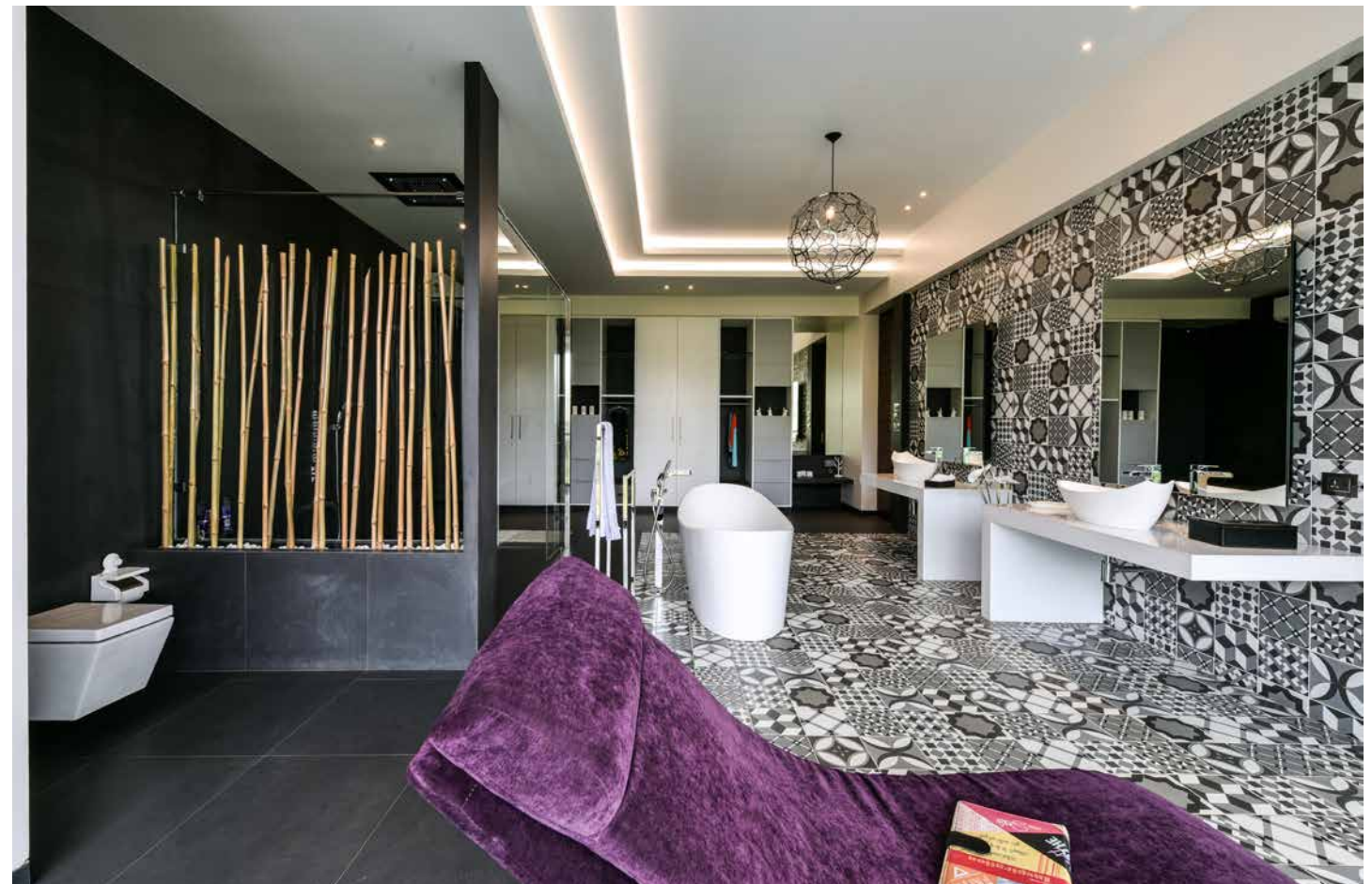
The washroom flaunts a free-standing bathtub, a wardrobe and a chaise lounge. Such luxury of size and aesthetics could only be achieved in the countryside, away from Mumbai.