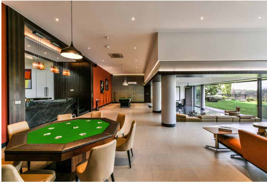
Raw wood center tables, quirky artefacts and a card table along, a pool table with a bar made of black marble form a vibrant entertainment area are some of the illustrious pieces of artwork. A small, minimal bar area has also been incorporated in the plan of the residence.