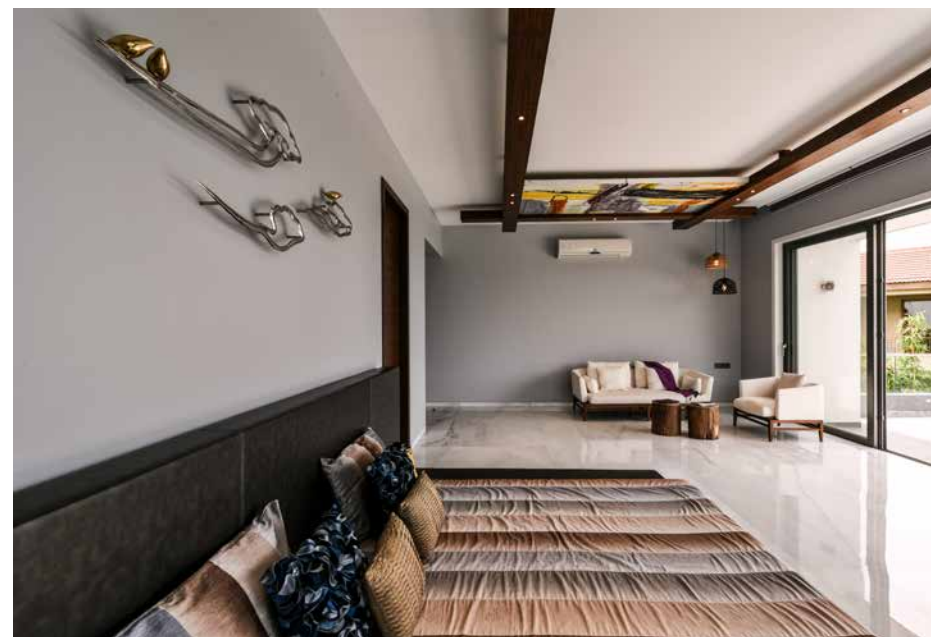
The daughter's room opens out on a huge balcony which is open to sky and has a scenic corner view of the scenic Khandala valley. A painting forms part of the ceiling design, while the rest of the bedroom is simple with a leather platform bed.