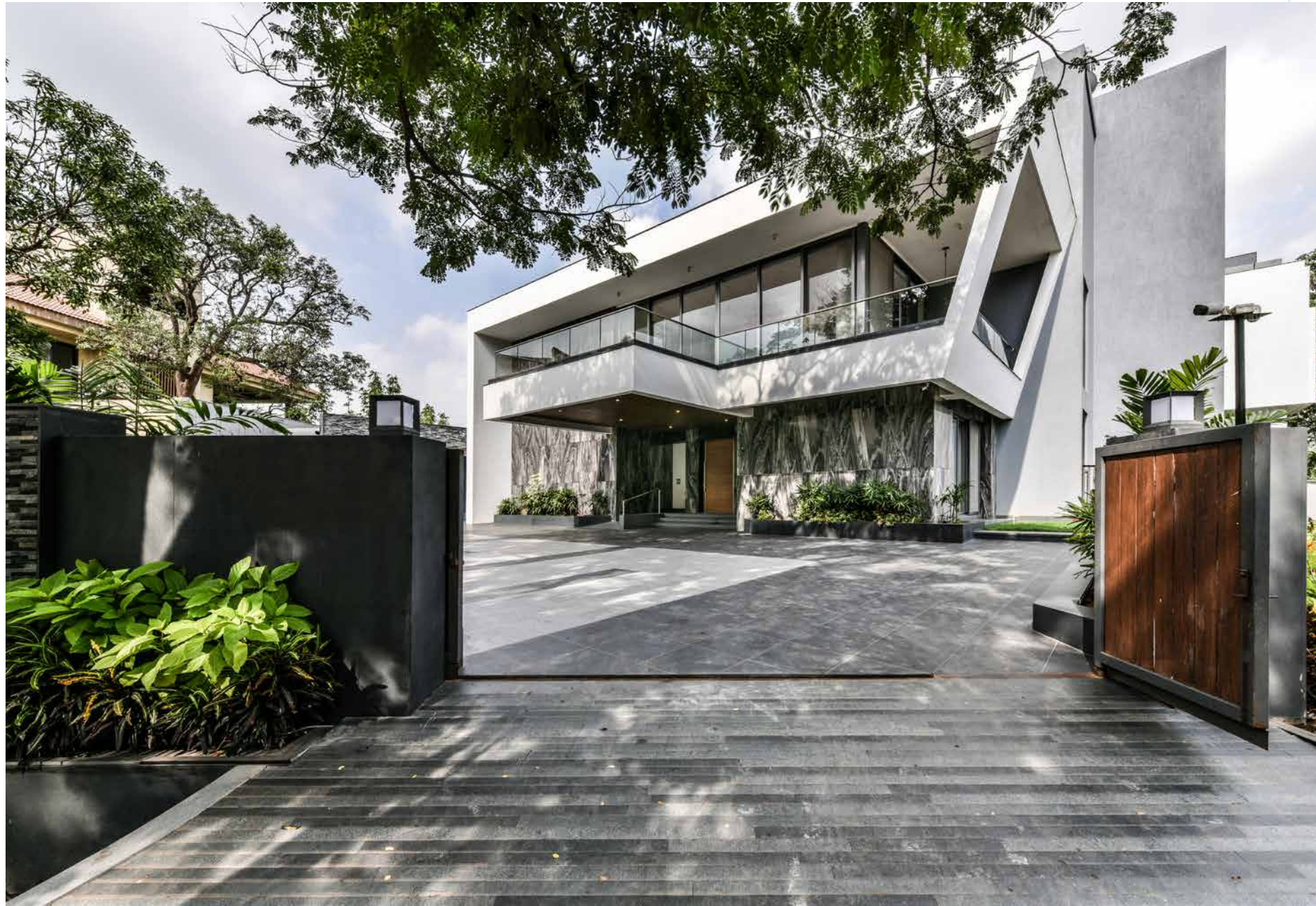
Project Location- Khandala, Maharashtra, India / Built up Area- 1115 sq mtr / Photography Courtesy- Prashant Bhat

Other Consultants-Integrated Building Services (Structural), Neha Electricals (Electrical), MR Enterprise (Civil), Mercury (HVAC), Hydrotech Consultants (Plumbing), Aum (Facade) & Dollar Shah (Stylist)