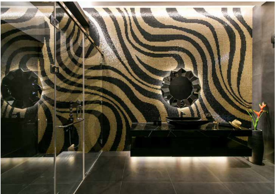
The washrooms are a luxurious affair with backlit mirrors and cove lighting enhancing the feel of the space.