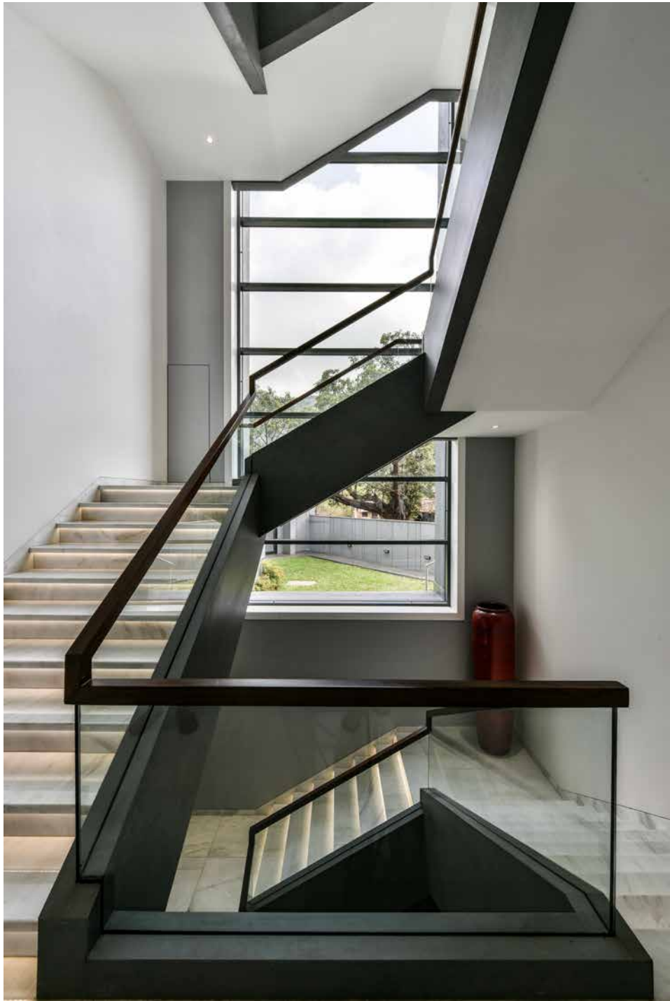
A white marble staircase with indirect LED lights under the risers of the staircase leads to the lower ground entertainment area.