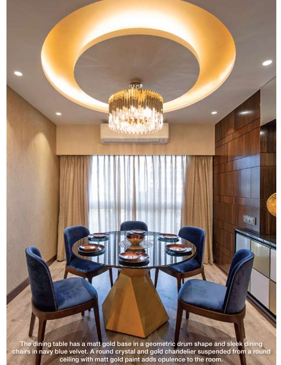
The dining table has a matt gold base in a geometric drum shape and sleek dining chairs in navy blue velvet. A round crystal and gold chandelier suspended from a round ceiling with matt gold paint adds opulence to the room.